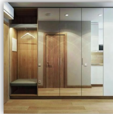
Furnished living areas/storage