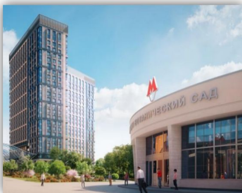
YE'S Botanica Aparthotel/Metro