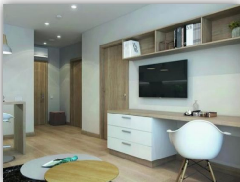
Furnished Study Areas